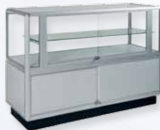
Counter Display Cabinet with Additional Storage