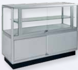
Counter Display Cabinet with Additional Storage

Create A Stunning Merchandising Display At The Point Of Sale With Glass Counter Display Cabinets