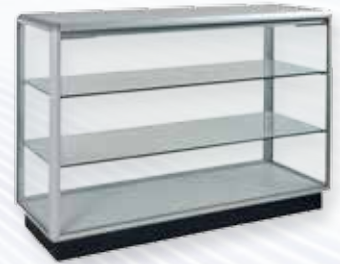
Full Glass Counter Display Cabinet