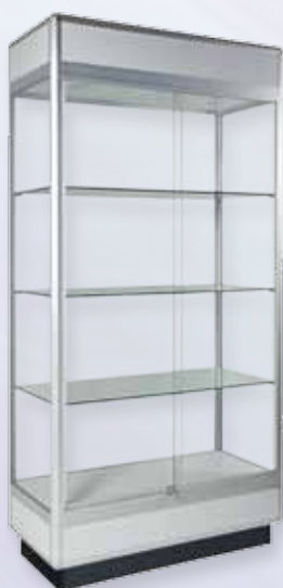
Upright Glass Display Cabinet

Up To 2m In Height, Tower And Upright Display Cabinets Are An Elegant Solution For Retailers