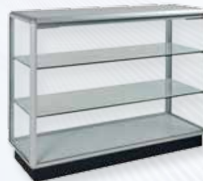
Full Glass Counter Display Cabinet

Delivered Australia-wide and fully assembled!