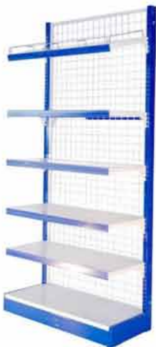
Product Title CODE: Description Dimensions