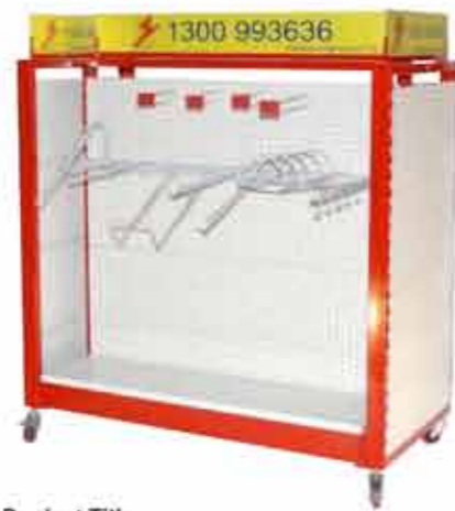
Product Title CODE: Description Dimensions