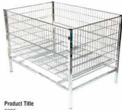
Product Title CODE: Description Dimensions