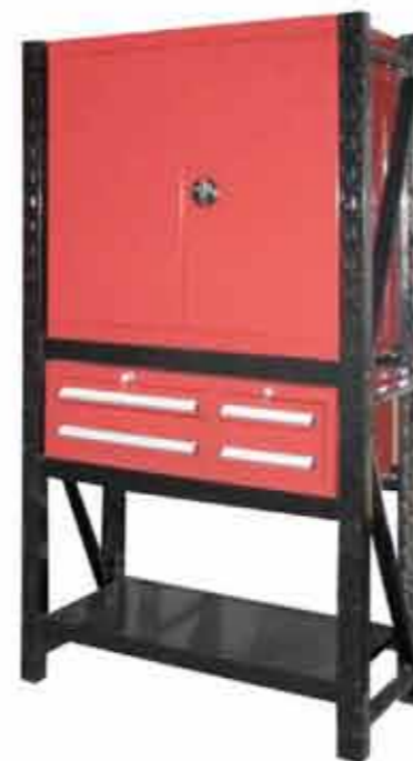
Product Title CODE: Description Dimensions