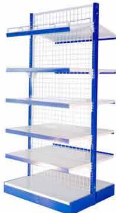
Product Title CODE: Description Dimensions