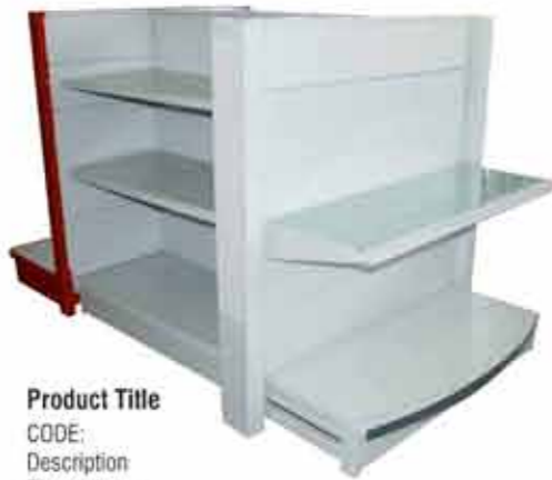
Product Title CODE: Description Dimensions