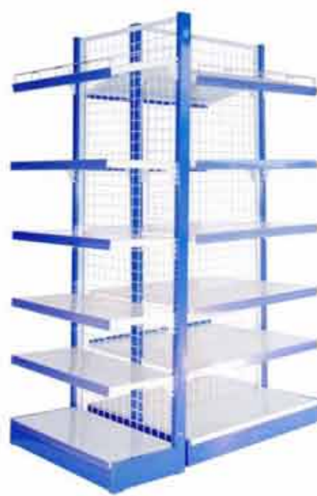
Product Title CODE: Description Dimensions