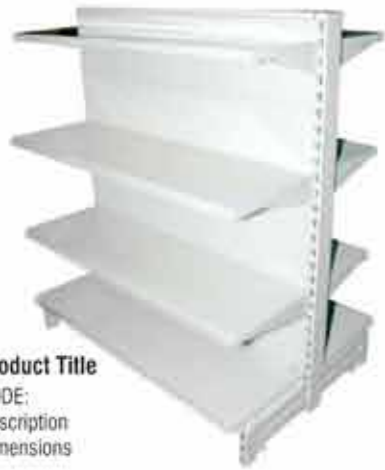
Product Title CODE: Description Dimensions