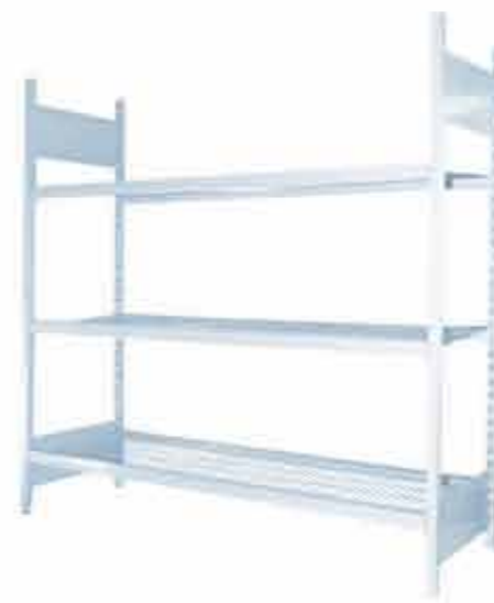
Product Title CODE: Description Dimensions