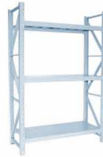
Product Title CODE: Description Dimensions