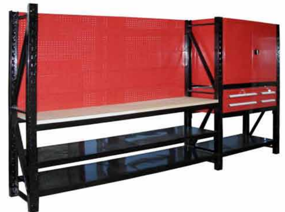
Product Title CODE: Description Dimensions